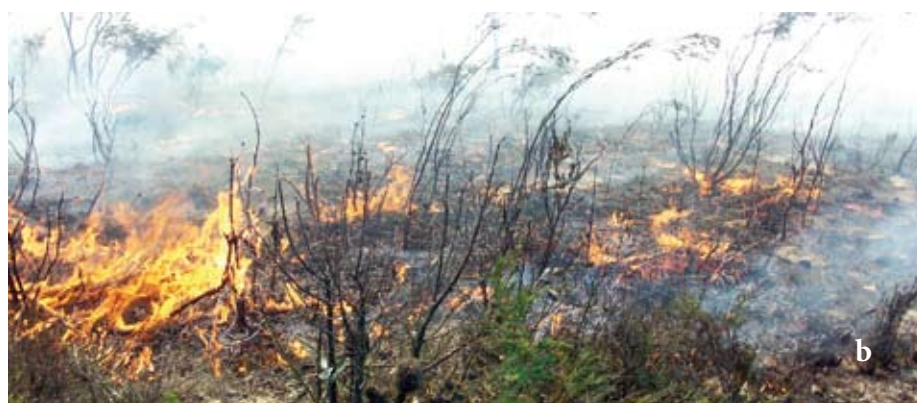
▲ Figure 5: The effect of a direct suppressant drop on fire behaviour as indicated by pre (a) and post drop (b) images taken during the Project FuSE Aerial Suppression experiments. Flames that were up to 2 metres were knocked down to less than half a metre and extinguished in some places. Although this drop had a large influence on this section of fire perimeter, it was not anchored and the fire quickly burnt around it, making it ineffective.

from holding fire spread. If the density of spot fires beyond the drop is high, or spots develop quickly, then drop effectiveness is greatly reduced.