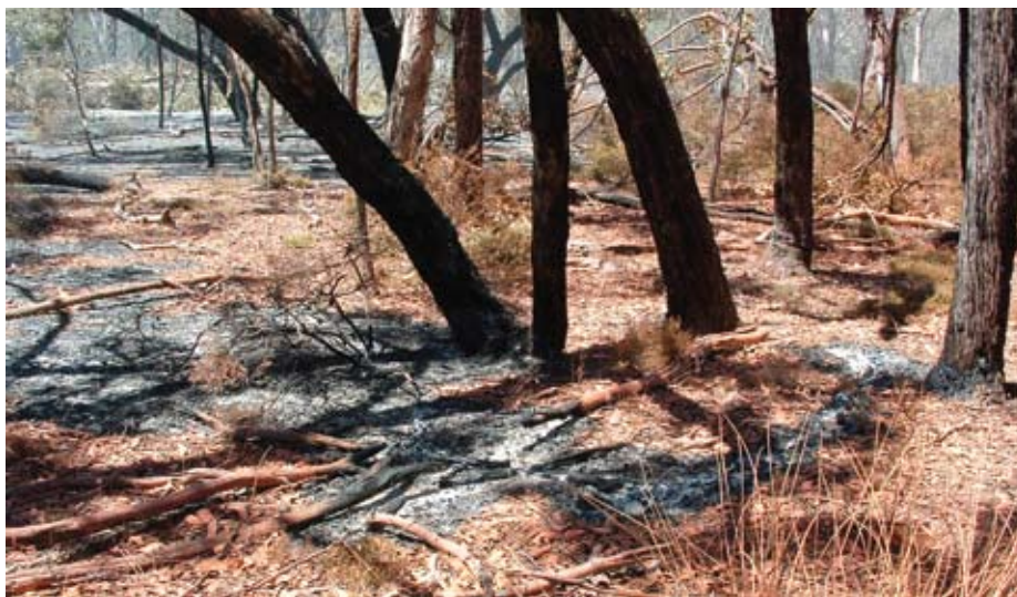
▲ Figure 3: This retardant drop held the fire despite being penetrated in some sections that were shadowed by the trees. Drops can be breached by fires trickling through sections of light coverage like this.