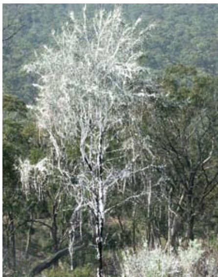
▲ Figure 4: High foam concentration drop adhering to a tree canopy. Drops like this will not penetrate thick canopies.

and retardants hold together well when dropping and are more resistant to wind drift. However, they have a high adherence to the canopy and limit the proportion of the drop that drips through. Such drops may also have difficulty penetrating into litter layers. Similarly, foam drops with high proportions of foam concentrate (>0.04%) may adhere to canopies due to the high surface tension (Figure 4, above). High concentration foam drops also mix with air when dropping and are more prone to wind drift.